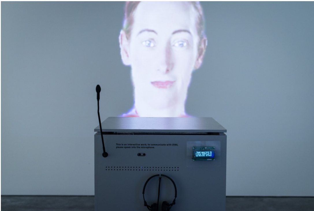
Lynn Hershman Leeson, DiNA, 2004, installation view, 'Lynn Hershman Leeson: Civic Radar', Yerba Buena Center for the Arts, San Francisco, 2017.