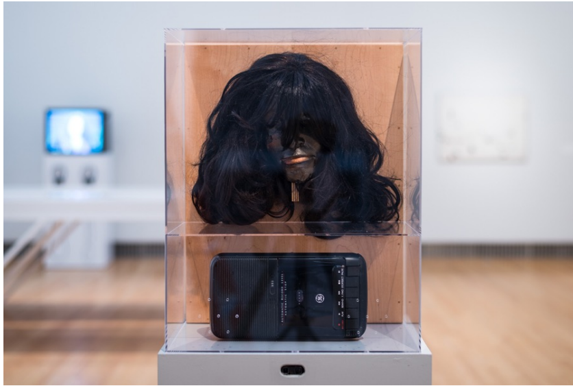
Lynn Hershman Leeson, Self Portrait as Another Person, 1965, installation view, 'Lynn Hershman Leeson: Civic Radar', Yerba Buena Center for the Arts, San Francisco, 2017.