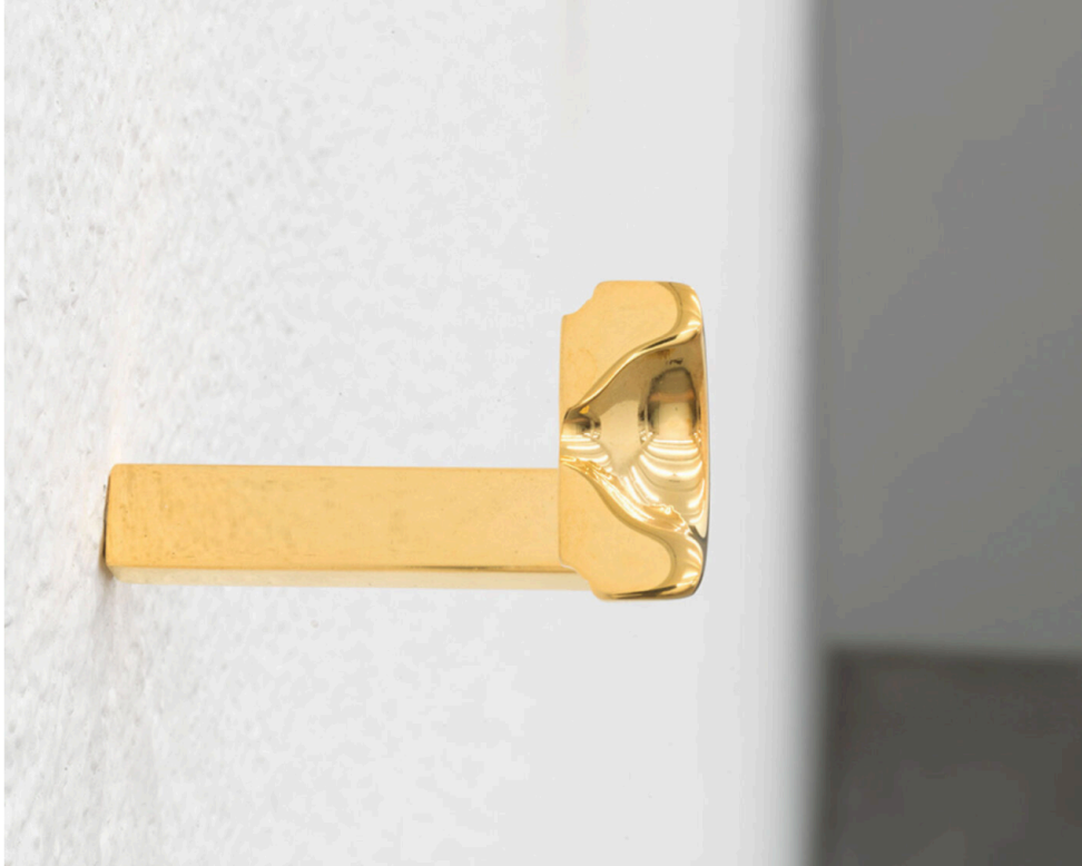
K.R.M. Mooney, ( v-viii ), 2021, gold, brass, solder, neodymium, 1 x 1.5 x 3 inches each.