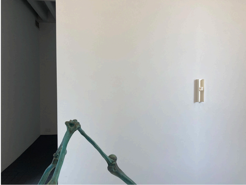
Installation view of K.R.M. Mooney, Deposition c. (iii) , 2021, Miguel Abreu Gallery, 88 New York.