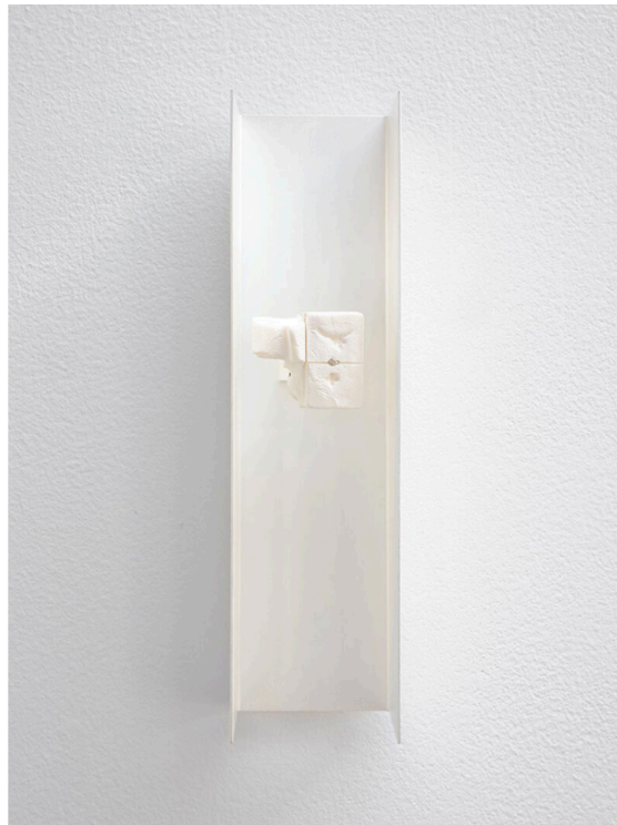
K.R.M. Mooney, Deposition c. (iii) , 2021, electroplated steel, silver, cuttlebone, aluminum, 10.5 x 2.25 x 3 inches.

Sculpture that attends to its materials and surroundings.