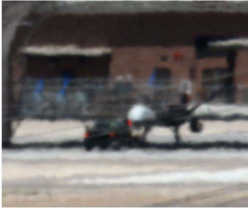
Trevor Paglen, Reaper Drone (Indian Springs, NV; Distance ~ 2 miles) (2010) C-print