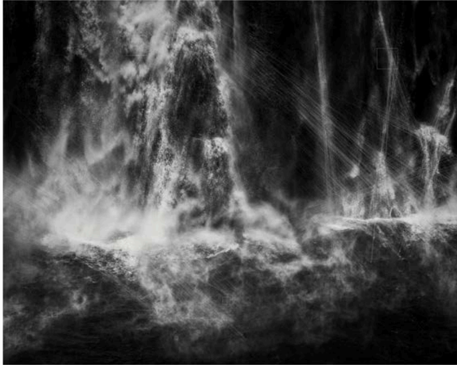
Trevor Paglen, Shoshone Falls, Hough Transform; Haar (2017) , silver gelatin print

It's more sympathetic in a way because when you're looking at a landscape or a system the person is removed, whereas with the AI works, you draw a connection with how our eyes interpret visual data for our brains.