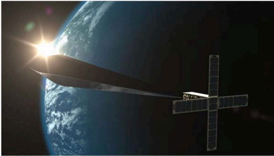
Design concept rendering for Trevor Paglen: Orbital Reflector, co-produced and presented by the Nevada Museum of Art

No, I think it's something much more pedestrian, like somebody who probably paid a lot more money than we did to be on the rocket isn't ready to go yet.