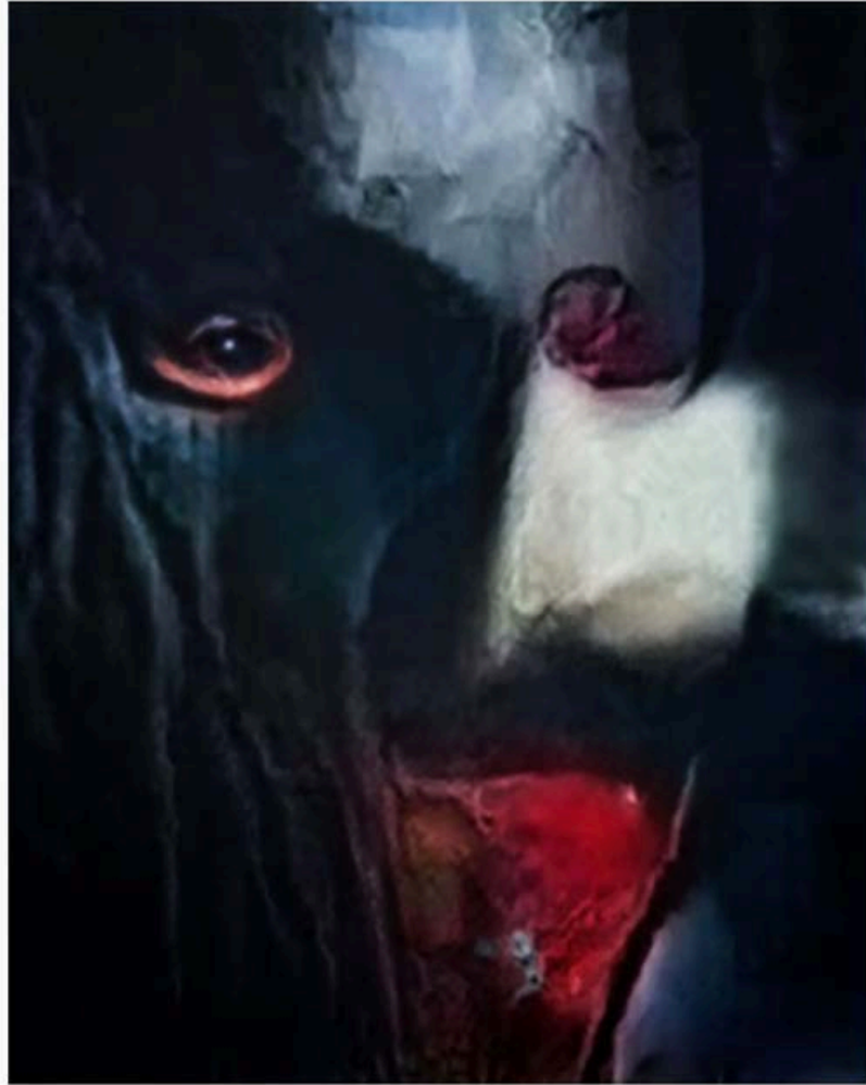
Trevor Paglen, Vampire (Corpus: Monsters of Capitalism) Adversarially Evolved Hallucination (2017), dye sublimation print

You need tremendous amounts of data in order to really make AI sing and make it do useful stuff. And because you need that volume of data, you can really only do it if you have an infrastructure that is basically a planetary-scale surveillance infrastructure. And then you have to have the ability to consolidate that information in centralised places, ie corporations or states. And so, given those two facts, the politics of the infrastructure is one of extreme centralisation of power in either nation-states, which China would be a good example of, or in corporations, like the Facebooks and Amazons.