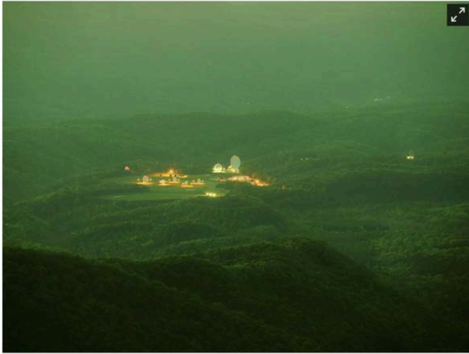
They Watch the Moon © Trevor Paglen