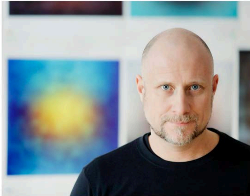
Trevor Paglen. Courtesy of the artist, Altman Siegel Gallery and the Cantor Arts Center.