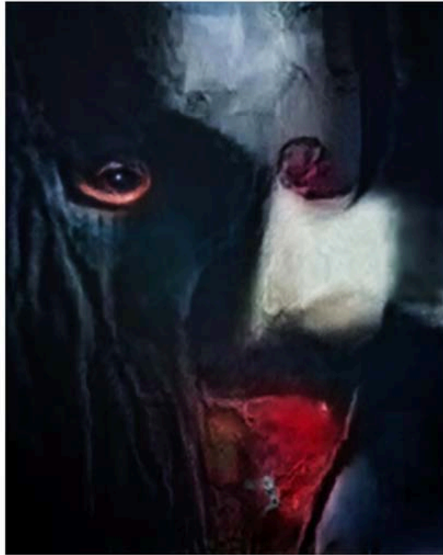
Trevor Paglen's Vampire ( Corpus; Monsters of Capitalism ), "Adversarially Evolved Hallucination" (2017).