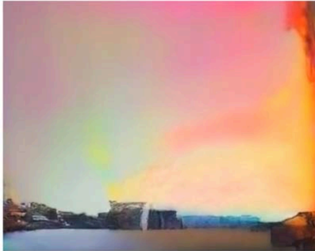
Trevor Paglen's Rainbow (Corpus: Omens and Predators), "Adversarially Evolved Hallucination" (2017).