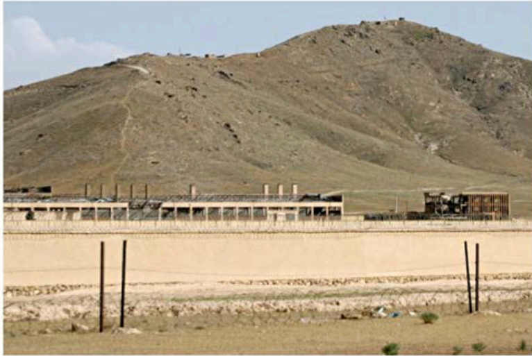
Trevor Paglen's The Salt Pit, Northeast of Kabul, Afghanistan (2006). Courtesy of the artist and Metro Pictures, New York.

Paglen's work has variously involved a satellite that orbits the Earth, serving no military, surveillance, or communications purpose, sent aloft only to reflect light back to Earth; a team of scuba divers who mapped the fiber-optic cables that transmit data to and from computers and telephones on distant continents—information that's swept up in government surveillance efforts; and a piece of computer circuitry standing inside a Plexiglas box in an art gallery, where it creates a wireless network for gallery visitors to use, and one whose traffic is protected from surveillance efforts with open-source anonymizing software.