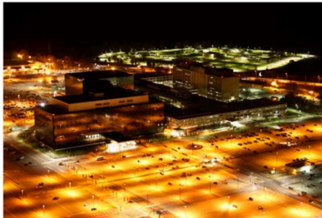
Aerial photograph of the National Security Agency. Commissioned by Creative Time Reports, 2013.

And that's not a trivial thing. This is directly related to things like social justice. Magritte saying "This is not an apple" reverberates in Civil Rights-era protesters saying "I am a man," or women saying "We are equal and want equal pay," or queer activists saying "I'm queer, deal with it," or trans activists saying "I'm neither man nor woman, but I'm still a person." Contesting meaning is a very human activity, and always a political activity. So when you're looking at these machine vision systems, politics of meanings and taxonomies are hard coded into them. And they're very strict. That's a big difference and that really has enormous potential consequences for how the world works.