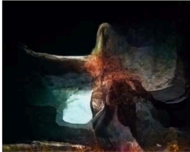
Trevor Paglen's Octopus (Corpus: From the Depths) , "Adversarially Evolved Hallucination" (2017). Image courtesy of the artist and Metro Pictures, New York.

Let's start off by talking about the work that you're doing with machine learning and artificial intelligence. Your most recent show at Metro Pictures, "A Study of Invisible Images," included a number of photographs created by asking artificial intelligence programs to create images of various subjects—comets, vampires, or rainbows, for example. Were those works at all intended to remove the artist's hand from the production of the work?