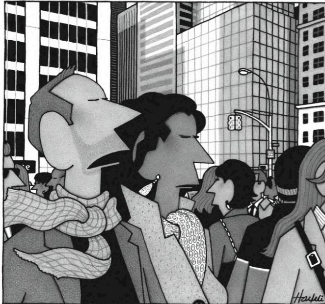
"I've been to cities other than New York. They're cute."

perhaps recognizing that the typical gallerygoer doesn't need much nudging toward a skeptical view of military activity anyway. He wants to place viewers in positions of productive uncertainty. "I don't put work in an art gallery because the next day I want people to march in the streets," Paglen says. He tries, rather, to stage disorienting encounters with "the sublime," which he defines as "the fading of the sensible, or the sense you get when you realize you're unable to make sense of something."