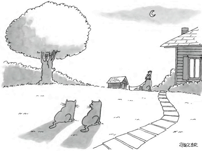
“How come the most ignorant among us are always the loudest?”

In 2005, Paglen began work on “Torture Taxi,” a book-length investigation into the U.S. government’s extraordinary-