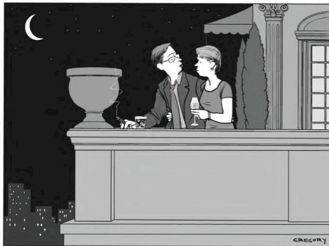
"A penthouse on Central Park West... not bad for a second-tier private-school kid from a postwar co-op on Riverside Drive, eh?"

Paglen said that blurriness serves both an aesthetic and an "allegorical" function. It makes his images more arresting while