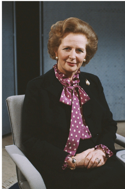
Left, Dara Khosrowshahi, the chief executive of Expedia at the Sun Valley Conference, 2016. Right, Prime Minister Margaret Thatcher, circa 1990.