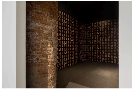
Lynn Hershman Leeson, “Logic Paralyzes the Heart,” 2022. Courtesy of the artist; Altman Siegel, San Francisco; and Bridget Donahue, New York.