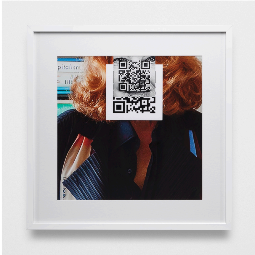
Lynn Hershman Leeson. "QR Identity Finder," 2022. Archival digital print. 25 1/4 x 25 1/4 in.