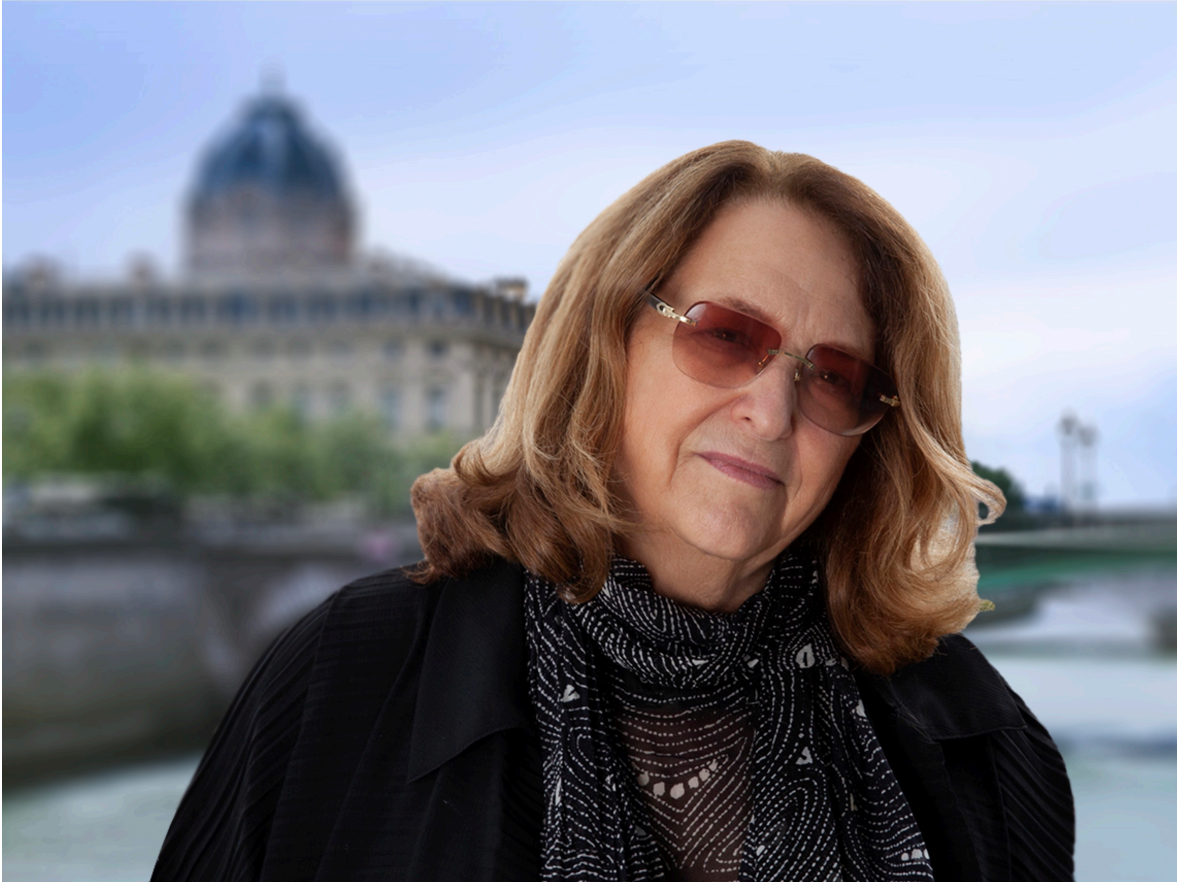
Portrait of Lynn Hershman Leeson.

By the time Y2K rolled around, Hershman Leeson's work had begun to focus on bio-politics. This is perhaps most comprehensively presented in her extensive, eight-room project, The Infinity Engine (2014), wherein she created an emblematically antiseptic, lab-like environment made up of a partially interactive, multimedia installation that included genetically modified fish, a 3D printed "human" nose, and a series of video interviews with doctors focusing on regenerative medicines and the human genome. By legitimizing Breitmore's identity through the cataloging of medical records, in particular, Hershman Leeson's foresight proved shrewd. This lays bare the underlying reality that the panopticonic structure within which we ALL exist is, at its core, based not on one's name, or even social security number, but on our blood, our very DNA!