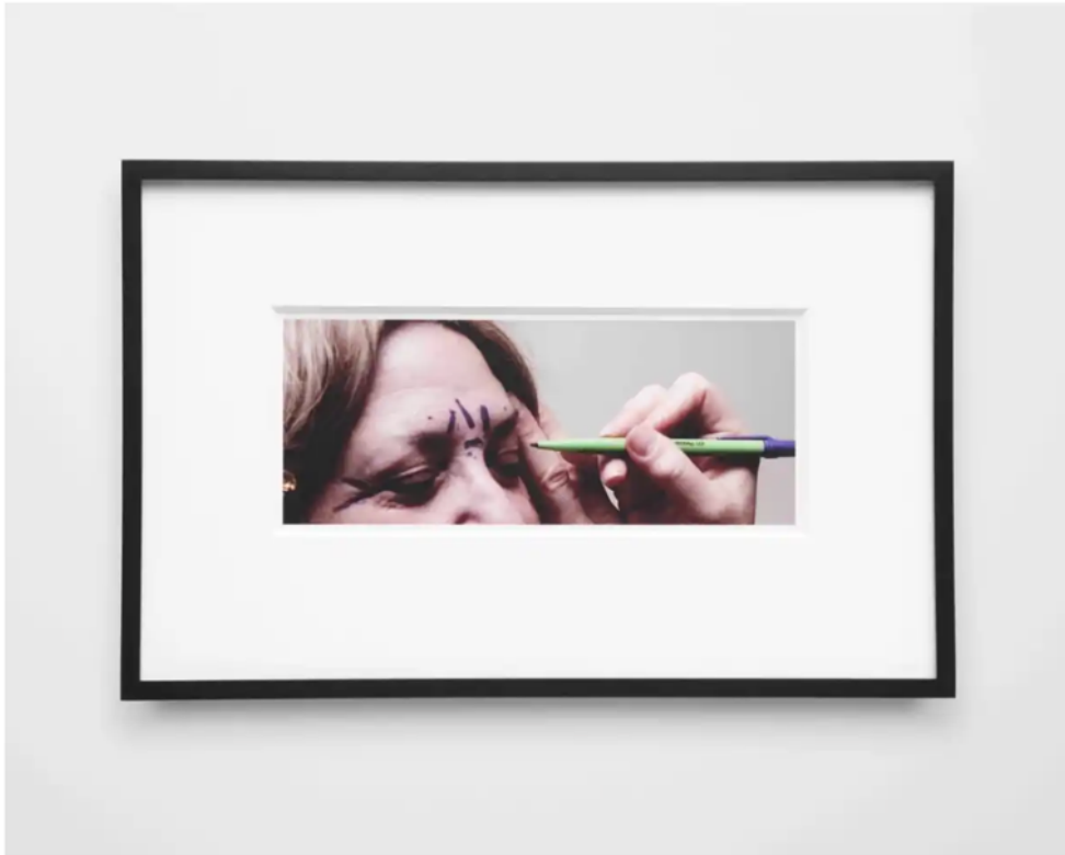
Lynn Hershman Leeson, Roberta's Reconstruction , 2005. Chromogenic print.

The thirty-nine works in the show encompassed more than five decades of Leeson's life and included paintings, sculptures, and photography—though Hershman Leeson's practice extends to film, performance, and installation, as well—a breadth that complemented the focus of the show: the depth of the artist's interrogation into the construction and enactment of individual identity.