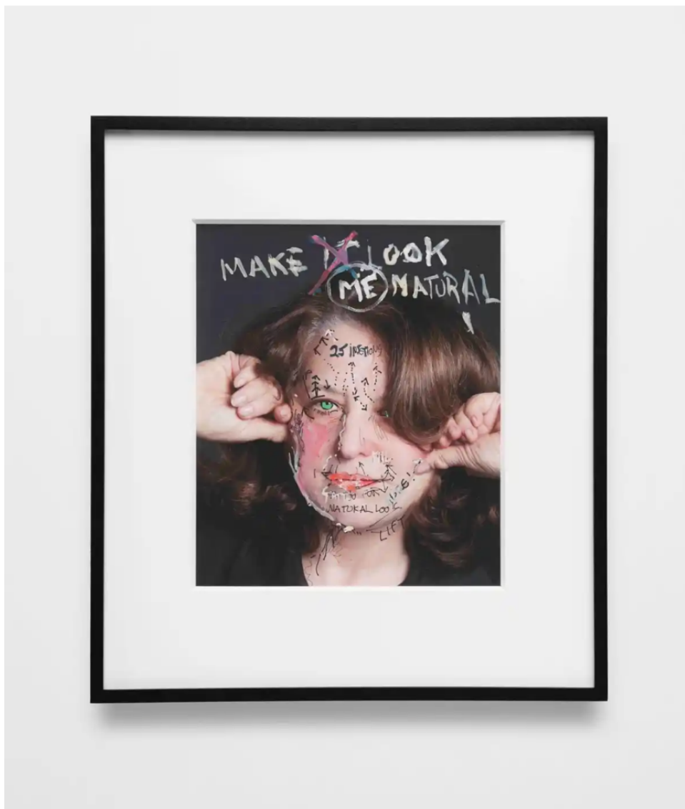
Lynn Hershman Leeson, Make Me Look Natural, 2019. Archival digital print, watercolor, pen, ink.