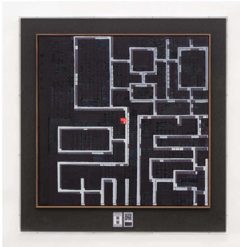
Simon Denny: Metaverse Landscape 5: Decentraland Parcel -132, -47, 2022

Simon Denny's paintings of virtual property continue his long-term project of giving physical shape to often formless phenomena.