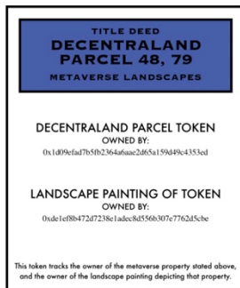
Simon Denny: Metaverse Landscape Title Deed 3: Decentraland Parcel 48, 79 , 2022

Simon Denny isn't the first artist of the post-internet generation to pivot to that oldest and most saleable of analog mediums, painting. But he's one of the few to have done so with dignity and mordant wit: the New Zealander's Metaverse Landscapes (2022) don't constitute anything like a quick cash grab, even if what they depict might. Specifically, Denny's primarily oil-on-canvas paintings, which superficially resemble geometric modernist abstractions—changeably gridded divisions of the canvas square—are in fact representations of digital real estate and corresponding tokens from the Decentraland metaverse, where users buy NFTs that confer ownership of “parcels” of virtual land. The canvases reframe and expand the notion of landscape painting into god's-eye map views, quadrant by quadrant, of this growing digital topography: the object, of course, of a recent speculative gold rush of sorts. At the base of each framed canvas is an Ethereum paper wallet, linked to a dynamic NFT that tracks, in real time, dual ownerships: that of the painting itself, and that of the land token. Painting might seem an incongruous medium for reflecting on such intangible transactions; or, alternatively, a perfect one for reflecting on how temporarily hot properties change hands. Denny's series of canvases here make the case for the medium's relevance: in their own hybrid way, they move, adapt, record, and—perhaps—side-eye.