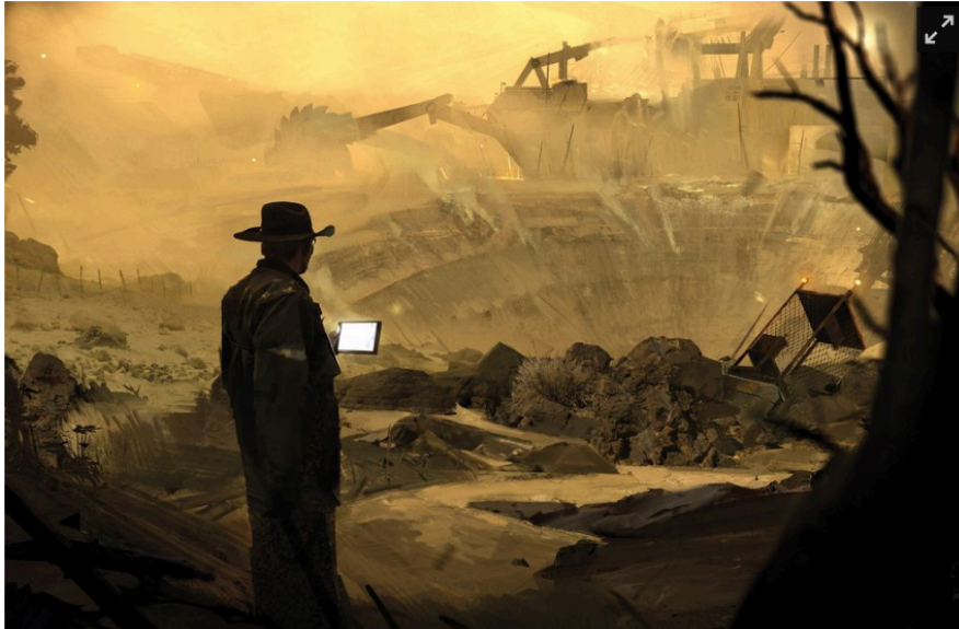
Simon Denny's Extractor 2019 © Simon Denny

“All of the objects in the show and all of the experiences are enhanced by the augmented reality”. One of those experiences is a King Island brown thornbill—a Tasmanian bird species facing imminent extinction—that will “live” on The O throughout the exhibition. “[It is] kind of like a canary in the mine of the Anthropocene,” Denny says. The irony of today’s mining for resources that power digital devices is not lost on Denny.