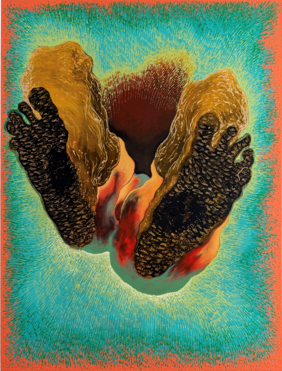
"Free Fall," 2023