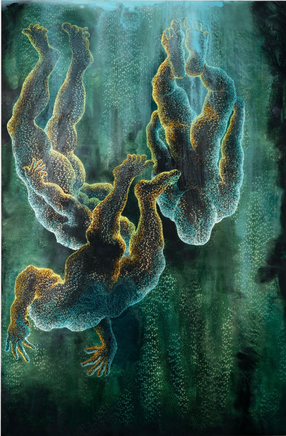
"Plonje (Dive)," 2023