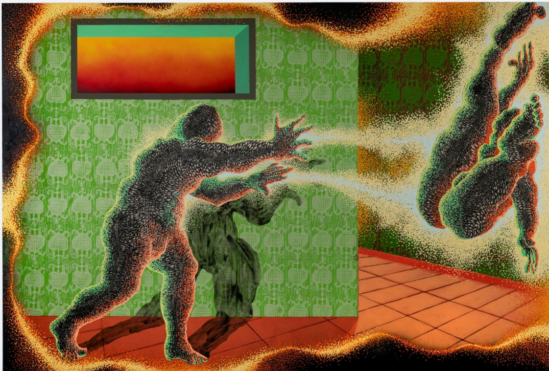
"I Wanted Her to Kill Him, I Know Why She Didn't," 2023

When I was around eleven, my mom used to work at this Haitian restaurant in Miami and her boss was terribly abusive. There were times that he tried to sexually assault my mom. One time, my father and I went to pick her up late at night and she got into the car crying. She started telling my father how nasty this man was, and I remember being in the back seat thinking: my dad is this big strong man, and my mom is the strongest person I know. How can they let this happen to her? Why doesn’t my mother just eradicate him? Why doesn’t my father just kill this man? Why don’t they just get rid of him? My eleven-year-old brain tried to find the simplest solution. And I wanted to go back to that moment and think about, if I could have actualised it then, what would it have looked like?