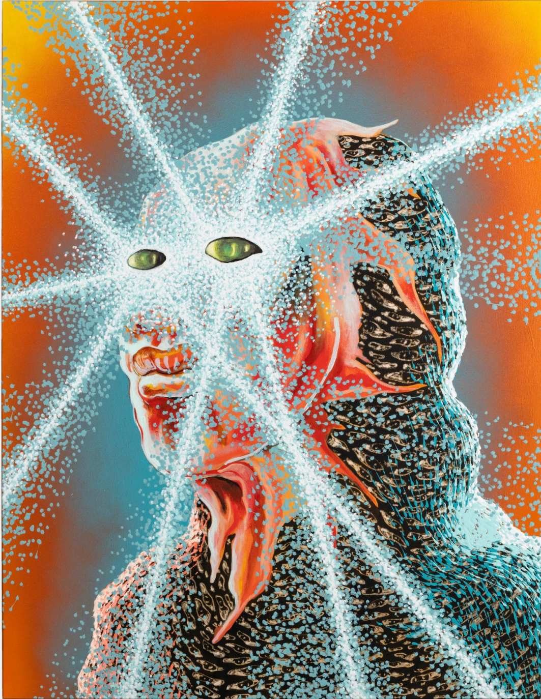
"Dezabiye: a Burning Glare Withheld," 2023