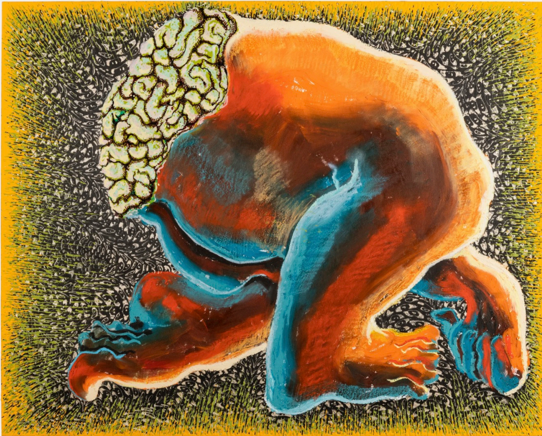
"Viande (Meat)," 2022

I describe it as magical realist. The mystical realm is part of our ancestry, especially within Haitian Vodou and worship rituals. I can't separate Vodou from how we identify as Haitians and how I — coming from the diaspora — conceptualise it, having left Haiti when I was six years old. As I am grappling with my own personal anecdotal history and those histories that have been passed down orally, you can't not include mysticism, mythology, Vodou and magical realism. That language has to be part of how I tell the immigrant story. The oral archive, for me, is just as important as the supposedly "stable" historical archive . The oral archive is organic, it is living and it is contained in the bodies of me, my siblings and our ancestors. That archive is just as important to me. I want to think about, when lightning comes from the sky, how does that remap an event as it lives in my memory? Now, that's a different kind of realism.