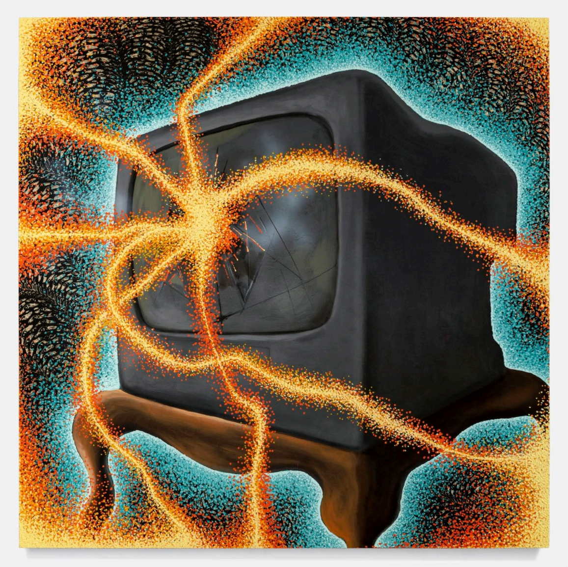
"TV Tyranny," 2023