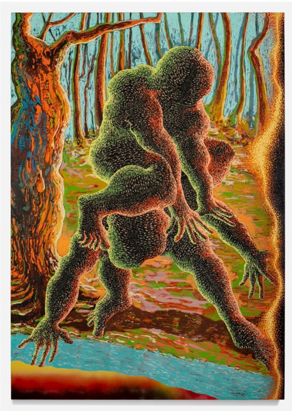
"Cheval: the Other Side of the Mirror is Home," 2023

It feels phenomenal to be here. This is the most personal work that I've made in a long time, and it's also the most mythological work that I've made in a long time. The MOCA show was an encapsulated survey of my earlier career. It feels really great to come out of that show with a new direction and introduce that new direction in a whole new space. It all feels pretty euphoric, honestly.