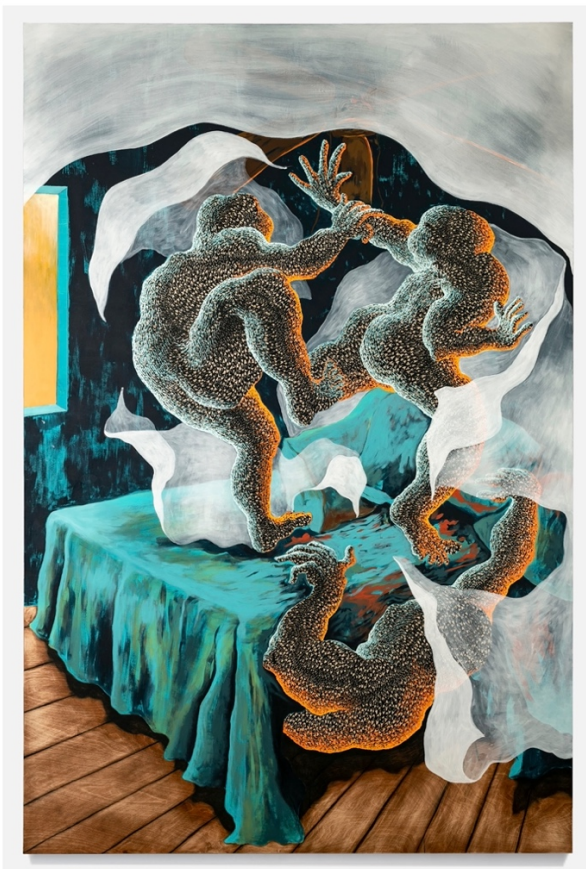
"My Father's Nightmares: My Sleepwalkers Cuddle Me," 2023