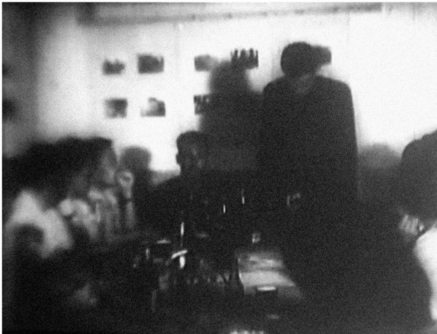
Trevor Paglen, CYCLOPS , 2023. © Trevor Paglen, courtesy Pace Gallery.

“In terms of the narrative structure and content of ‘CYCLOPS,’ it’s living in the world of MKUltra and mind experiments,” said Paglen, referring to a secret CIA program involving interrogation, brainwashing, and psychological torture. Much of the evidence of MKUltra was destroyed; the “evidence” gamers find stands in for those documents.