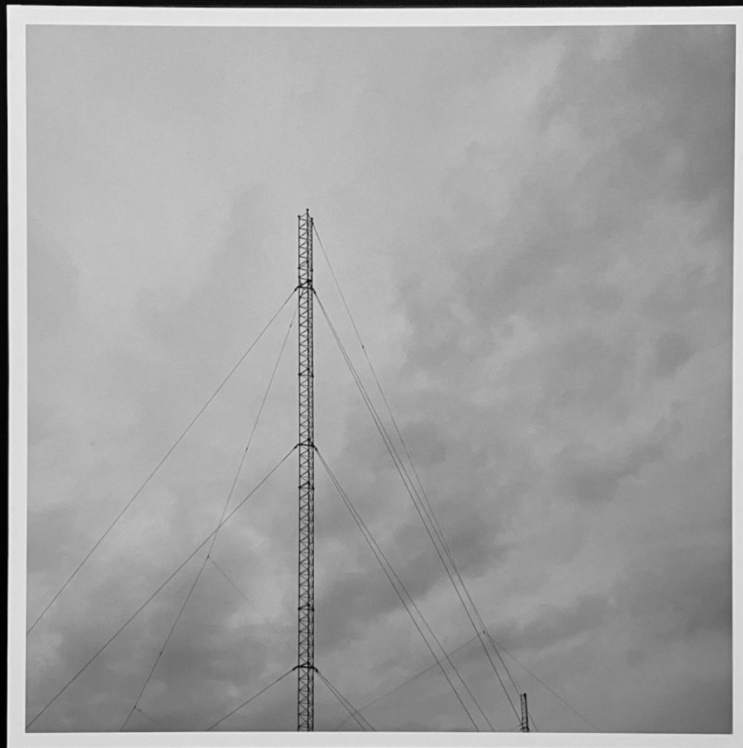
Trevor Paglen, CYCLOPS , 2023. © Trevor Paglen, courtesy Pace Gallery.