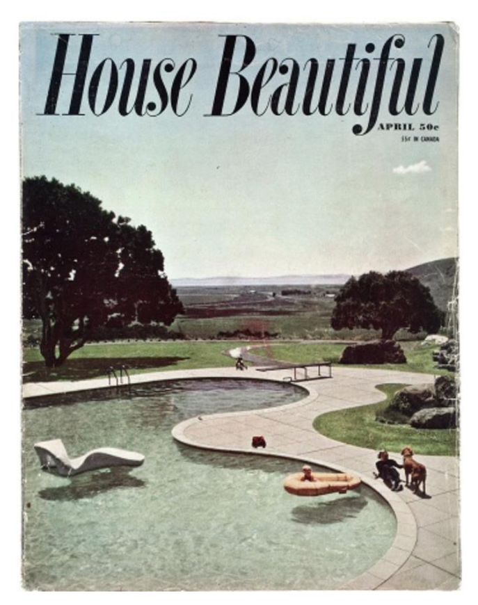
House Beautiful April 1951 2 for blog

1150 25TH ST. SAN FRANCISCO, CA 94107 tel: 415.576.9300 / fax: 415.373.4471 www.altmansiegel.com