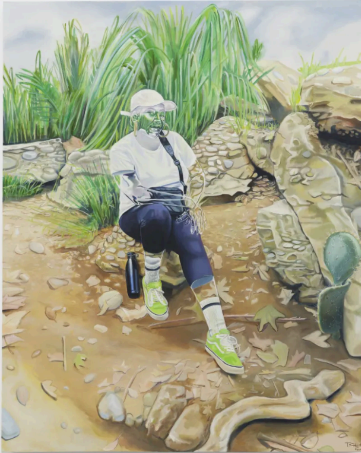
Troy Lamarr Chew II, "Office Break" (2024), oil on canvas, 60 x 48 inches (152.4 x 121.9 cm)