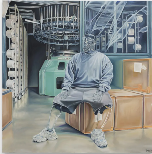
Troy Lamarr Chew II, "The T-shirt Pusher" (2024), oil on canvas, 48 x 48 inches (121.9 x 121.9 cm) (all images courtesy the artist and Altman Siegel, San Francisco)