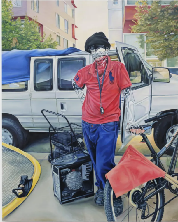
Troy Lamarr Chew II, "Hold the blocc down" (2024), oil on canvas, 48 x 36 inches (121.9 x 91.4 cm)

Murky areas amidst careful detailing can be found in many of the works. "Hold the blocc down," for instance, features an unclear object at the lower left — perhaps the edge of a tent — hinting, along with a small array of surrounding possessions such as a bike and shopping cart, at life lived on the street. The car behind the painting's subject, partially seen through his translucent head, seems as much shelter as vehicle, with a tarp covering much of its roof.