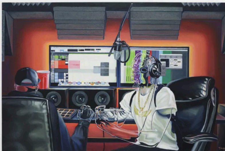
Troy Lamarr Chew II, “Sweet Lullabies” (2024), oil on canvas, 36 x 67 5/8 inches (91.4 x 171.8 cm)

In “Sweet Lullabies,” the saturated almost-rainbow palette of a computer monitor’s read-out bleeds through and highlights details of a singer’s face in a recording studio. His arm extends ever-so-slightly toward the foreground of the painting, his fingers tensed with a kinetic engagement that contrasts with the languidness of the figures in most of the other paintings. While the stillness of those people suggests not simply waiting but the fundamental suppression of vitality by their circumstances, the singer comes alive with the signs of his musical performance — one instance where cultural forces allow personal expression to shine through.