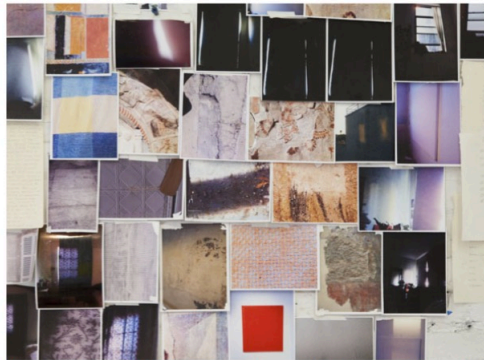
Photographs on Dickinson’s studio wall.

Jessica Dickinson: I was thinking about a moment of sharp clarity being materialized, like that black line marking the open rectangle, but then also making visible everything that led up to that moment—as if seeing multiple ways of attempting to understand something at once. To me it’s like a strange sensation of understanding time in a very material sense. Sensations can be physical, like the carved out sections, or ethereal, like the light—and then almost linguistic, like the opaque black line. In a way, I thought of all these paintings as having this sort of archaeology, if that’s the right word. So, it’s interesting that you say that it’s all of the paintings I’ve ever made combined because I feel like it’s also the other five paintings for the show combined in it. For this show, I wanted to create an environment where there were multiple and differing spaces and times at once, and this is the centerpiece where it is all collapsed.