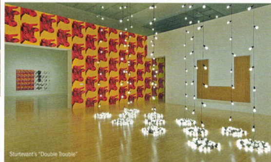
Sturtevant's "Double Trouble"