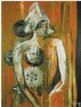
Albert Oehlen's Selbstportrait Als Holländerin [Self-portrait as Dutch Woman], 1983