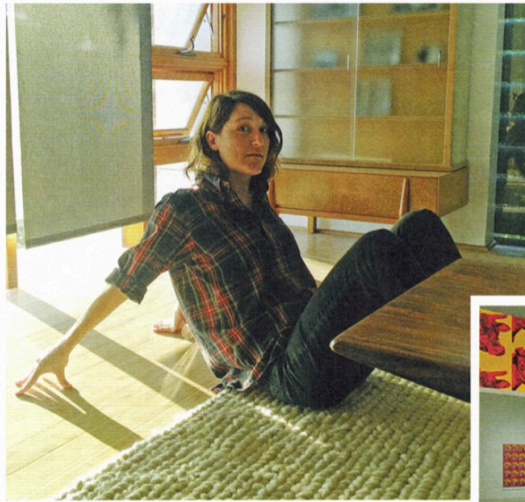
COURTESY THE ARTIST, GAVIN BROWNS ENTERPRISE, THE ARTIST AND GALERIE MAN-KETZLER, BERLIN (SELBSTPORTRAIT ALS HOLLÄNDERIN); 366 MISSION (FINITE/INFINITE)