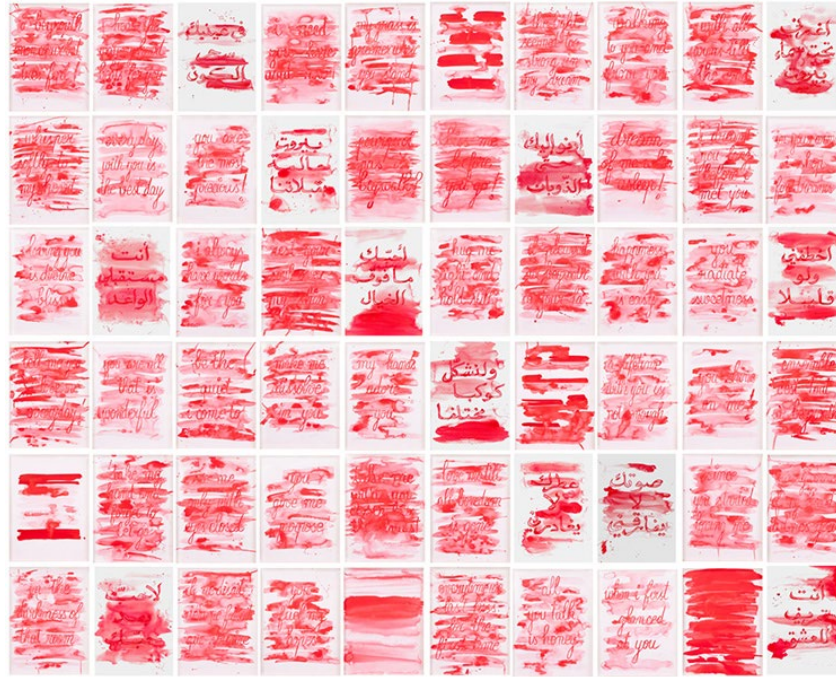
Kiss me before you go II, 2012, ink, watercolor, acrylics on archival paper 120x240 cm each panel unframed (246x126 cm each framed) (246x630 cm 5 panels framed)