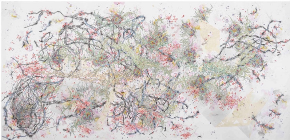
Hiba Kalache, 56:10-40. Acrylic on paper, 150 x 310 cm. 2017

I took the notion of 'hope' that we, as humans, embody, and that aids us in surviving or dealing with trauma and pain. In my interest in allegorical narratives, I turned to the description of the heavens in religious scriptures and studied specific passages for the production of my work.