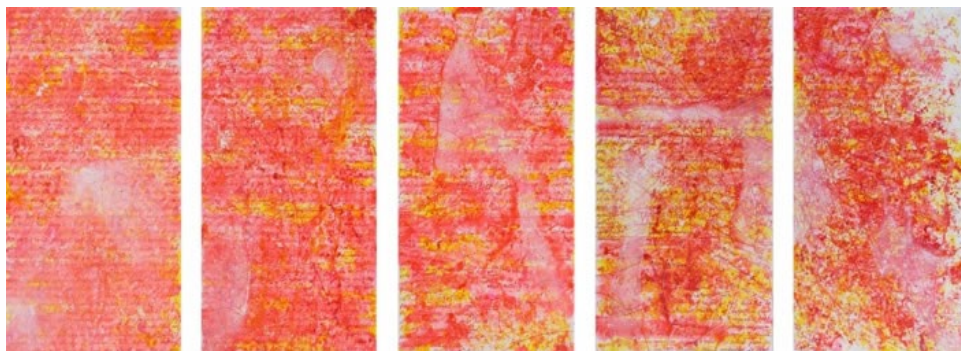
I Love You Because..., 2012, ink, aquarelle & acrylic on paper, 240 x 120 cm (5 drawings)

The composition of a 2D work begins in an orderly manner with a division of spaces. Hand-drawn/painted intricate details are gradually added until structures and hybrids take form. Movements and rhythms then come into play to (inter)connect the whole and break down the original order. The interaction that takes place between the various visual elements is of great interest to me. This interplay seems to embody relationships between smaller parts and a larger whole, such as between an individual and a partner, or a larger community/society and it reminds me of the interdependence of systems. The resulting work becomes a visual plane for the viewer to decipher, as well as a dialogue between the viewer and me. There is almost always clearly an event taking place, or many smaller ones, but what is not necessarily clear is the cause or the outcome of the event.