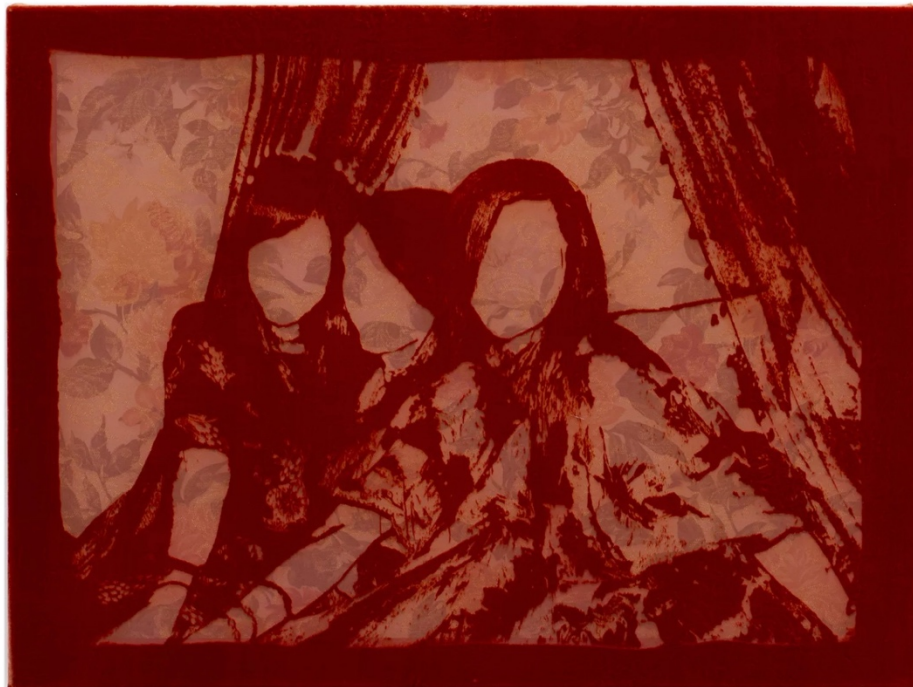
Yasmine Nasser Diaz Thick as Thieves , 2020 Ochi Projects